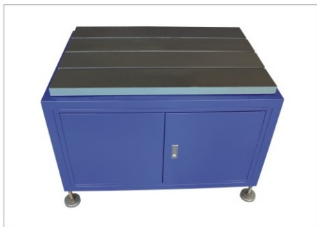
CAST IRON PLATE WORK TABLE