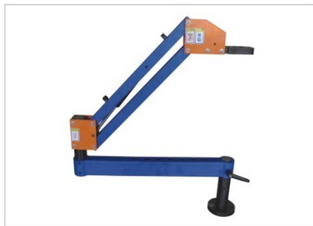
1000MM RADIUS FLEXIBLE ARM