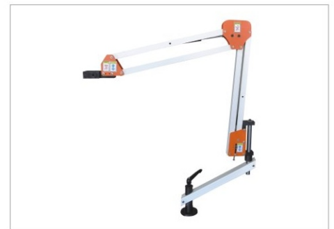
1900MM RADIUS FLEXIBLE ARM