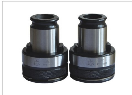
QUICK CHANGE TAP HOLDER